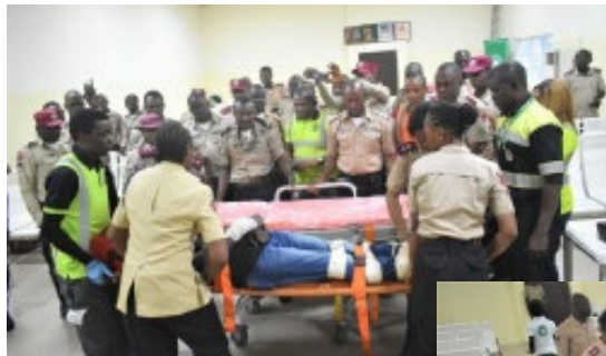
Female Officers evacuating a "casualty"