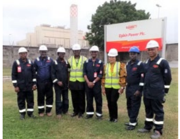
Part of the Hazard Hunt Team