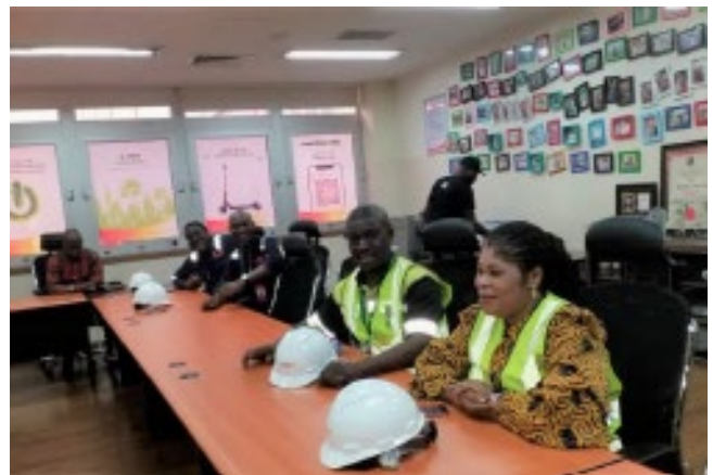
Debriefing after the hazard hunt