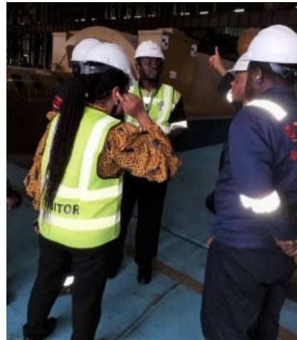
Tour of the plant...