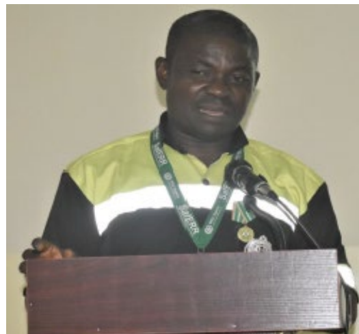
The GG commended the WSO-NG SafERR Directorate for sponsoring the training and awards.

The total cash prize of N35,000.00 was hand out to deserving participants & one free scholarship for Safety training at ISPON.