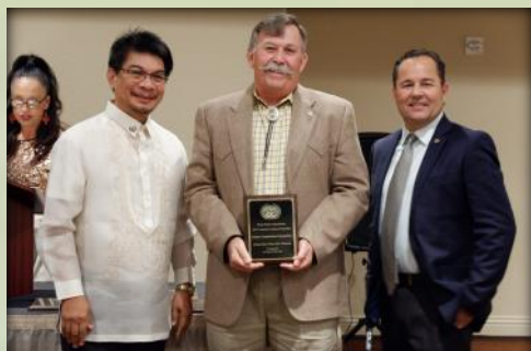
WSO Concerned Company/Corporation Zachry Construction Corporation