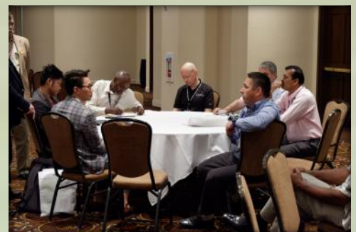
Participants in Global Safety Roundtable