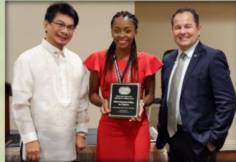
WSO James K. Williams Award WSO National Office for Nigeria