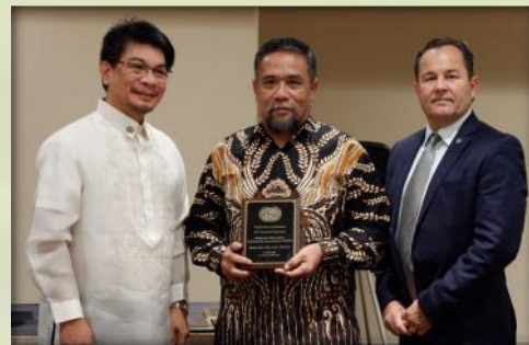
WSO Concerned Organization Indonesia Mining Safety Professionals Association (APKPI)