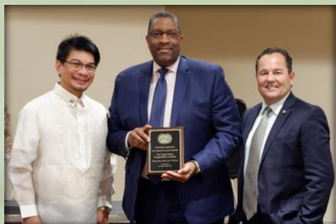
WSO Concerned Company/Corporation The Capital Metro Transportation Authority