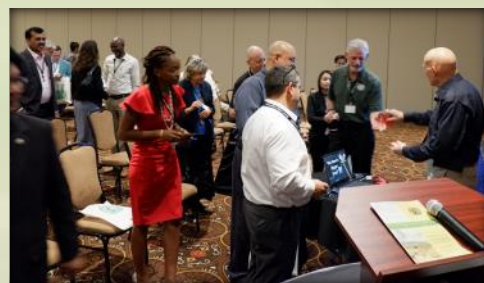
End of Keynote Presentation