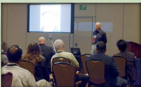
Attendees participate during Keynote Presentation