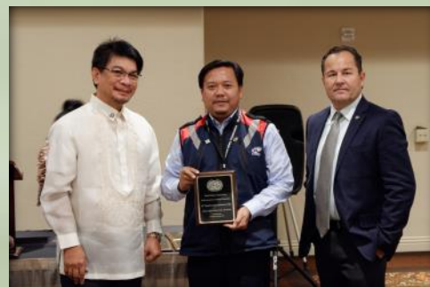
WSO Concerned Company/Corporation PT Waskita Karya (Persero) Tbk