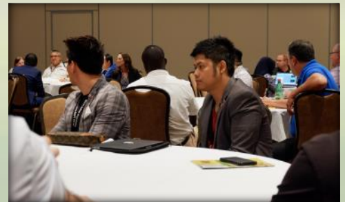
Participants in Global Safety Roundtable