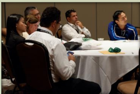
Participants in Global Safety Roundtable