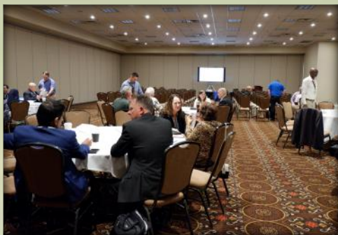
Monday Morning Meet-and-Greet Social