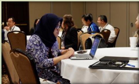
Participants in Global Safety Roundtable