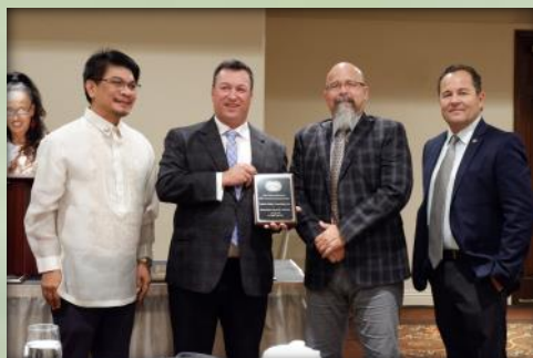
WSO Concerned Company/Corporation Cobalt Safety Consulting, Inc.