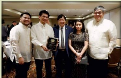
WSO International Office of the Year WSO International Office for Philippines