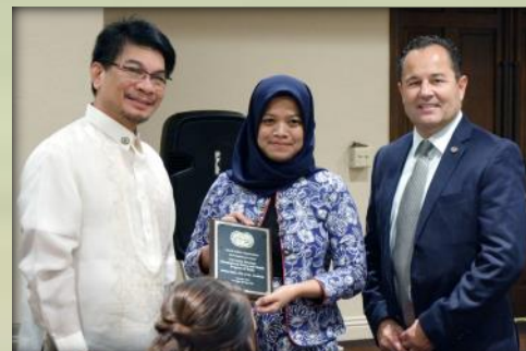
WSO Educational Award Binawan University