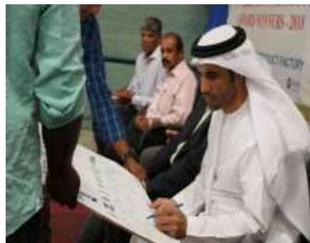
Signing the Health & Safety pledge.