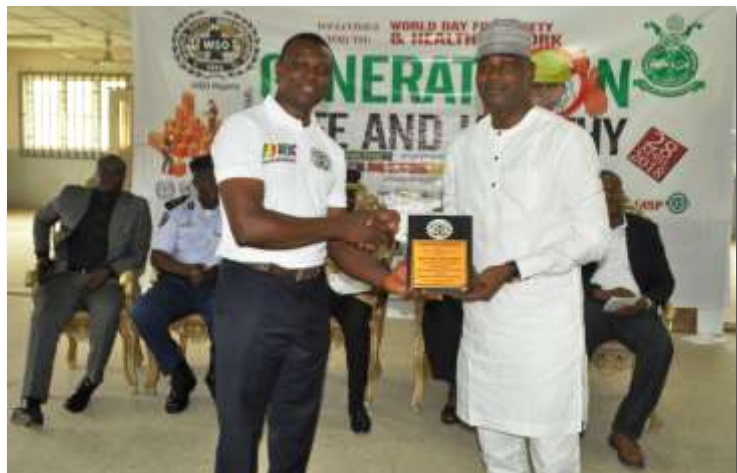
Soji Olalokun makes special recognition presentation to the Hon. Mika Amanokha (Hon. Commissioner for Youths and Special Duties, Edo State)