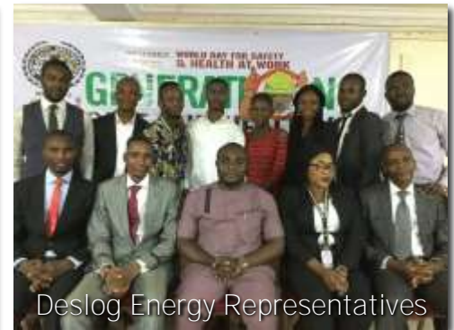
Deslog Energy Representatives