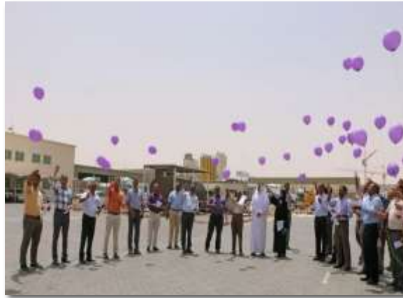
Balloons are released in commemoration of workers who were made ill, injured, disabled, or killed in the workplace.

“OSH Vulnerability in Young Workers” was the main agenda of the function, defining the protection of young workers in workplace and aiming to stop child labour. Representatives from Industrial Development Beaurto (IDB) and Alain Municipality, along with the Managing Director, General Manager, and Corporate HSE Manager of Nael Group, each conveyed their messages and defined the role of safety culture throughout the organization.