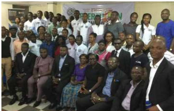
Participants of the Port Harcourt (Rivers State) SafeDay