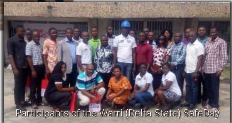
Participants of the Warri (Delta State) SafeDay

A s an International Professional Health, Safety, Security and Environment Organization established to help assure healthy and safe working conditions for agencies, organizations, individuals and the general public as well as provide training, education, research, and information related to the field of occupational, environmental, safety, security and health and international professional membership in the safety profession, The World Safety Organization has keyed into this annual event as a way of promoting her objectives of making safety a way of life ... worldwide.