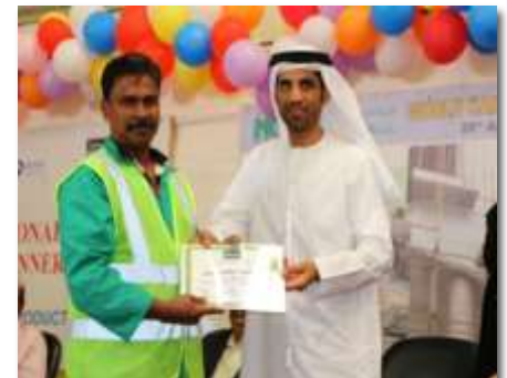
Presentation of the “Best Safety Employee” Award