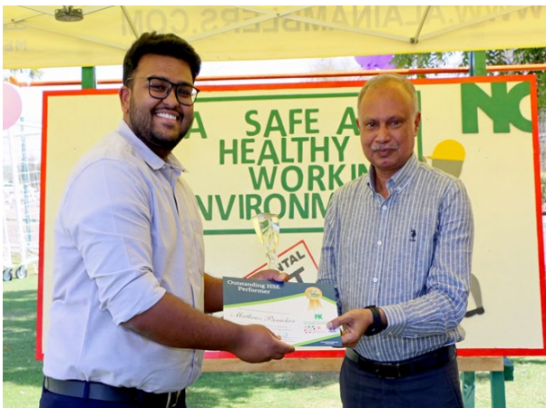
Outstanding HSE Performer award