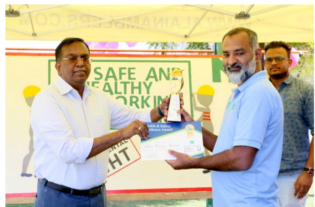
Distribution of safety awards