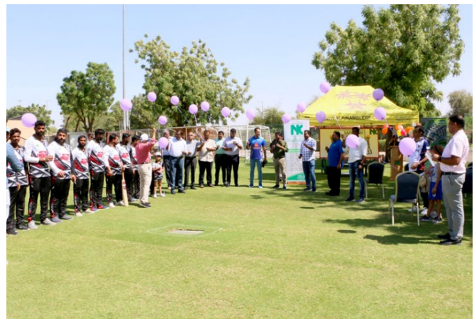
NGC employees releasing violet balloons as a part of commemoration