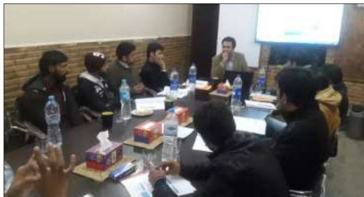
Process Safety Management workshop, held 7 January, in progress