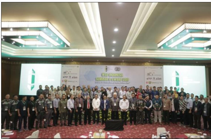
Four Members of the Board of Directors of WSO Indonesia together with Dirjen Binagakkum of Man Power Ministry, four Recipients of WSO Indonesia Award, and some Participants of WISA-2019 Event, at Balai Kartini, Jakarta