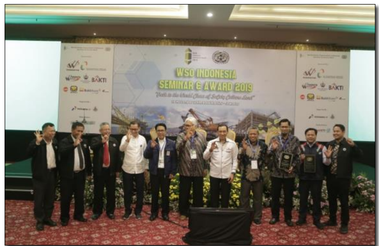
Four Members of the Board of WSO Indonesia together with Dirjen Binagakkum from Ministry of Manpower and the recipients of WSO Indonesia Award, at Balai Kartini – Jakarta