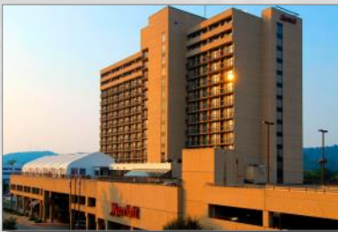
PHOTO: Marriott Charleston Town Center

The Marriott Charleston Town Center invites business and leisure travelers to immerse themselves in style, comfort and elegance. It features an unbeatable downtown hotel location in West Virginia's capital city, close to top destinations like Charleston Civic Center, CAMC General, and world-class shopping, restaurant and entertainment options in the heart of the city. All hotel rooms provide a flat-screen TV, deluxe bedding, a well-lit work area, high-speed Wi-Fi access, and a coffee/tea maker. In addition, you'll enjoy a fully-stocked fitness center, heated indoor pool, and dining at Brick Salt Bar+Kitchen. With 17,000 square feet of adaptable venue