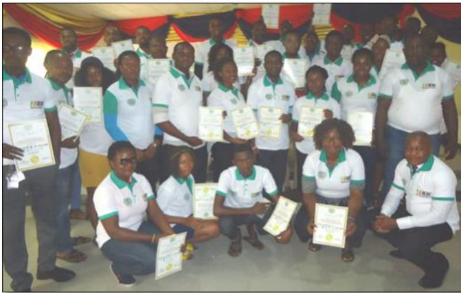
WDSHW Port-Harcourt, Ace International Center, Port-Harcourt