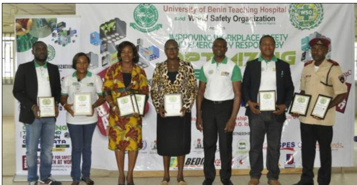
WDSHW-Benin, University of Benin Teaching Hospital, Benin City