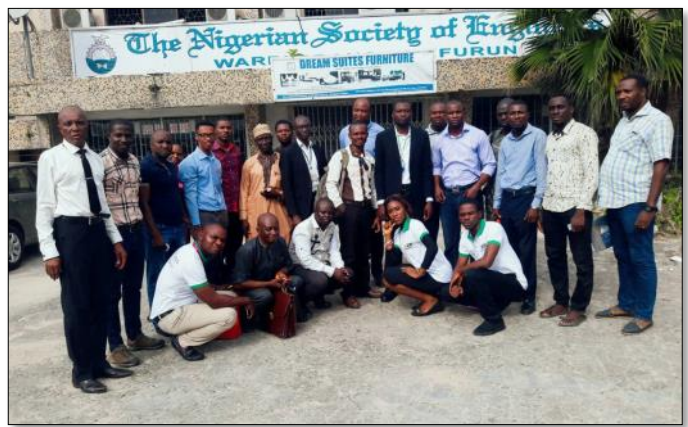
WDSHW Warri, Nigerian Society of Engineers, Effurun, Warri