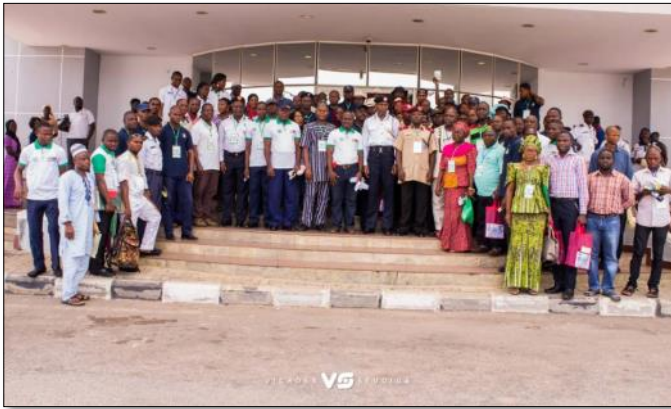
WDSHW Ilorin, Kwara State Banquet Hall, Ilorin