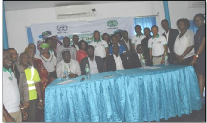
WDSHW Lagos, United Nations Information Centre (UNIC), Lagos