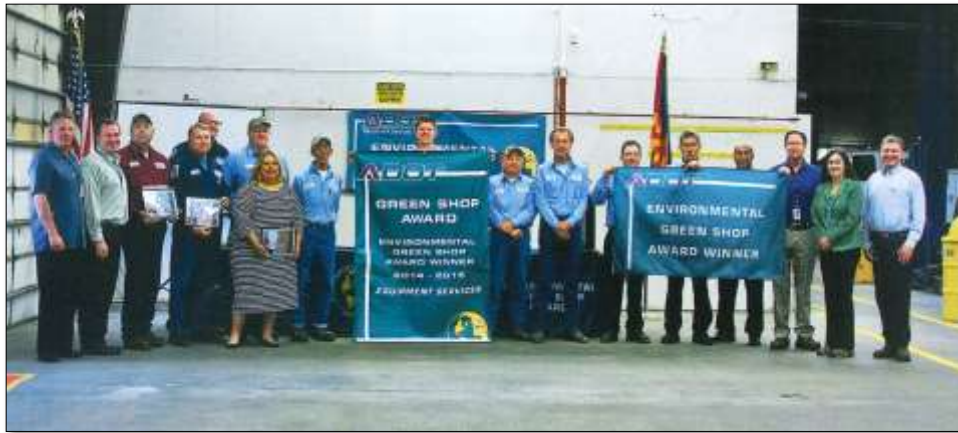
Tucson Equipment Shop is Presented the 2016 Green Shop Award for Main Shop

In April 2016, ADOT Equipment Services held a ceremony to present the Green Shop Award for the "Main Shop" winner to the Tucson Equipment Shop Green Team. A second ceremony, for the "Satellite Shop" winner Green Team was held in May 2016 in Springerville, AZ, to honor the Springerville Equipment Shop.