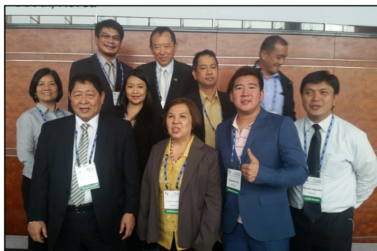
Representatives of WSO International Office for Philippines attended the 30th Annual APOSHO Conference in Seoul, Korea, May 31–June 4.