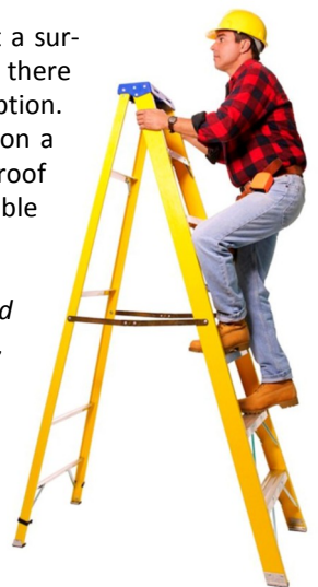
Three-Point Control Method

On the other hand, the three-point-control method requires a worker to use three of his or her four limbs for reliable, stable support. This climbing strategy could prevent many of the ladder falls and deaths occurring throughout the