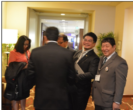
Philippine Delegation arrives for Registration